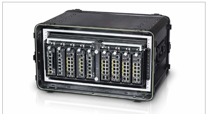
PacStar Fiber Reinforced Plastic Transit Case