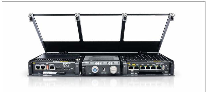
PacStar 1 RU RMF with two PacStar 400-Series Modules and encryptor