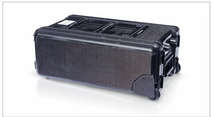
PacStar Carbon Fiber Transit Case with Front Cover Attached