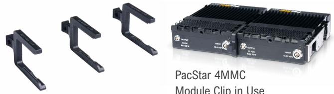
PacStar 4MMC Module Clip in Use

PacStar 400-Series module-sized storage container slides into PacStar Smart Chassis empty slots and provides storage for small accessories like cables or module clips.