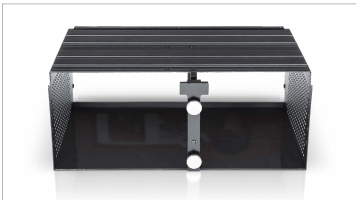
PacStar 4 RU RMF (Rugged)